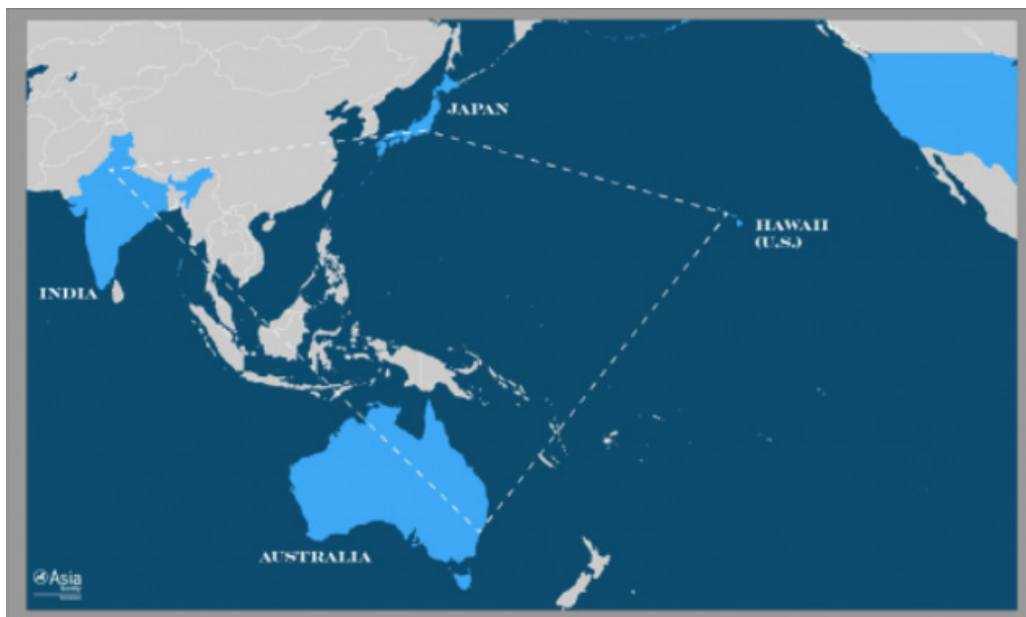
Figure 3: Quad countries.

In practice, the US's strategic focus is neither Indo, nor Pacific. It is Asia, and specifically China. The reality of this focus is highlighted by the 2018 change of name of the US Pacific Command, located in Hawai'i, to Indo-Pacific Command (INDOPACOM). This change was reported as recognising the US role in countering Chinese influence in the region. 38 The locus of Hawai'i as the point of the US gaze makes sense with this repositioning. In this context, securing the maritime domain is therefore much more about the eastern coastal areas of Asia than about either the Indian or Pacific Oceans in their wider sense.